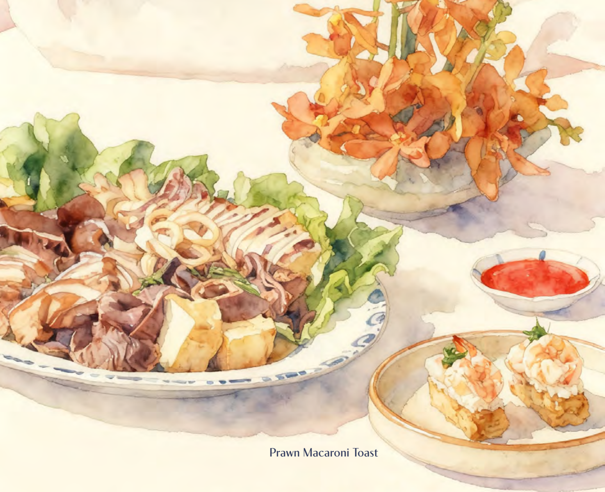
Prawn Macaroni Toast