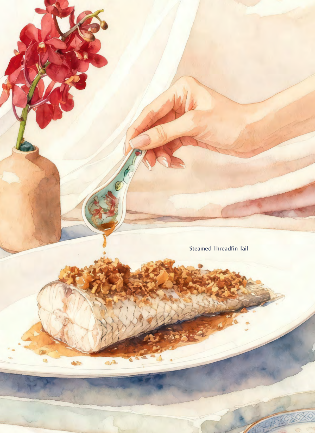
Steamed Threadfin Tail