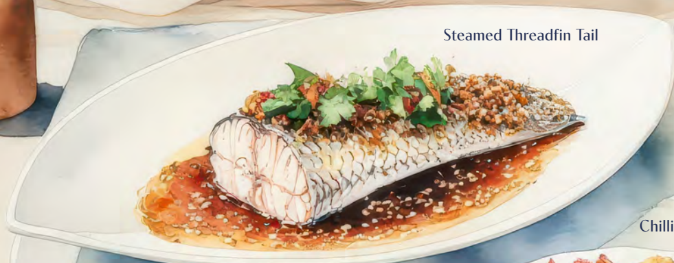
Steamed Threadfin Tail