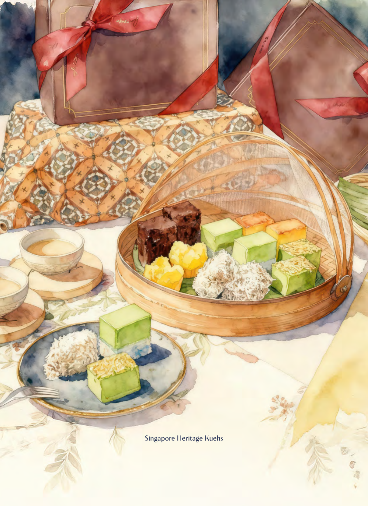
Singapore Heritage Kuehs