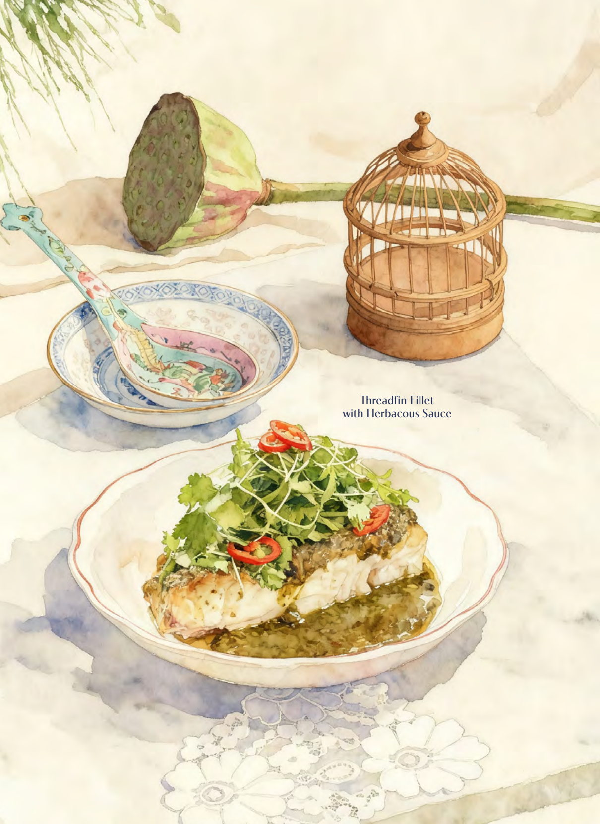
Threadfin Fillet with Herbaceous Sauce