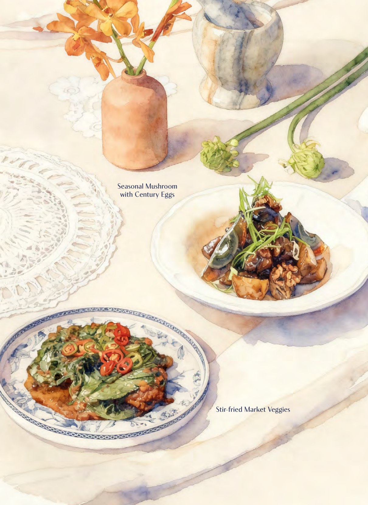
Seasonal Mushroom with Century Eggs