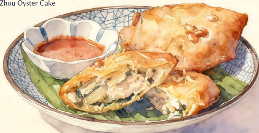
Fu Zhou Oyster Cake