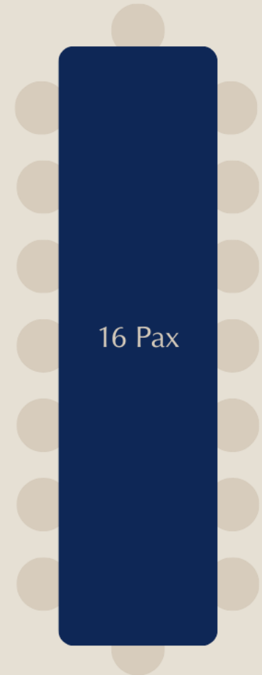
Alternate configuration, 16 persons